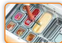
Bulk Ice-Cream 2.4L/5L