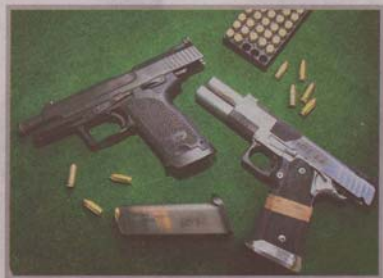
Lethal: Check out these 9mm semi-automatic firearms (near right, a Glock and, far right, an STI Eagle).